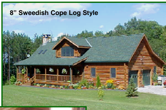
8" Swedish Cope Log Style